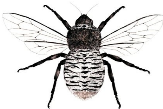
White Tiger Bee

Seeing a complete body of Horn's work, shows her constant exploring of both the medium and the subject. They are elegant, beautifully realised drawings that have a language to them that goes beyond observational drawing. Each drawing demonstrates the beauty of the subject and offers an insight into the artist's interpretation of the world around her.